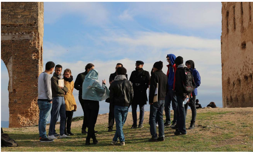
Rencontre artistique «Créer en espace public», Fès, Maroc, 2017.